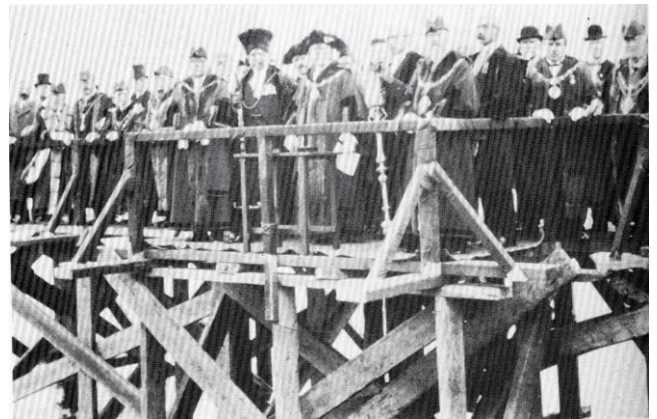
The Lord Mayor of London opens Island Barn Reservoir, 4 November 1911

The reservoir cost £152,727 and was built by Robert McAlpine and Sons, the same company that has built the Olympic Stadium for the 2012 games. It is worth remembering that the Victorians did not have the labour saving equipment that construction companies have today. Around 1200 navvies worked on the reservoir and completed it well ahead of schedule. It was officially inaugurated and named by the Lord Mayor of London on 4 th November 1911.